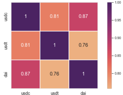
Figure 1: 3Pool Stablecoin LP correlation matrix. Assets are USDC, USDT and DAI and is calculated over a 45 day range.

Since all these tokens are pegged to the US dollar, it is natural that correlations are high. However, correlations can change drastically in periods where any of these assets have lost their peg 2 .